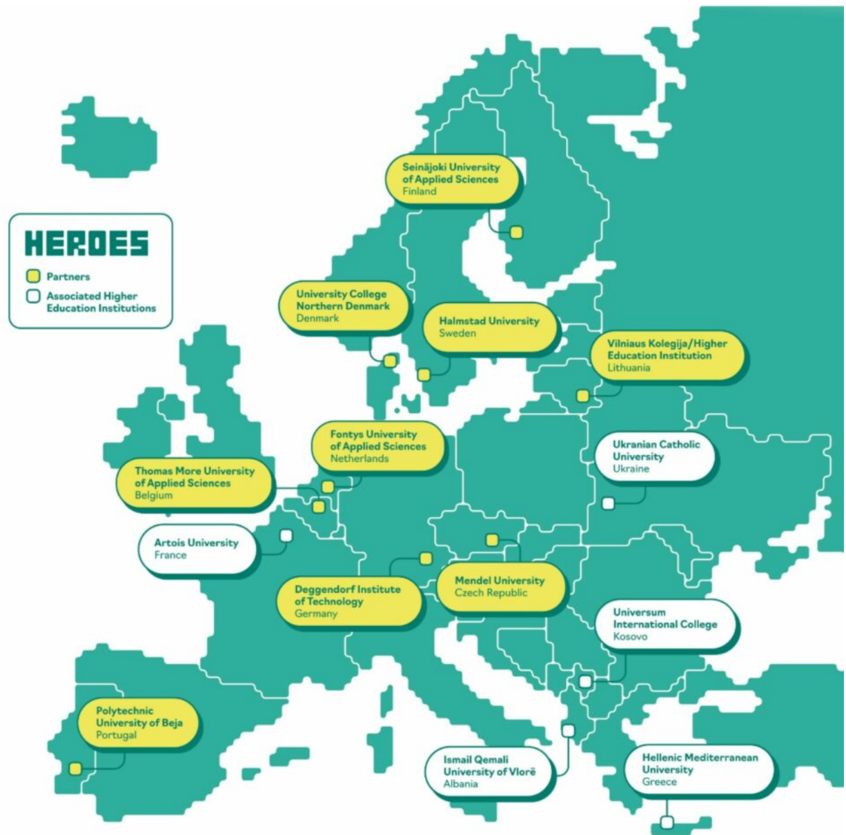
Image 1. HEROES partners.

The primary objective of the report is to provide a thorough assessment of both current and future skills demands within each region where HEROES institutions are located. This assessment is driven by the imperative to align upcoming joint educational offerings with the dynamic needs arising from three interconnected interdisciplinary focus areas: the resilience of people, businesses, and nature. Fundamentally, these needs are being reshaped by the powerful forces of digital transformation, the ongoing green transition, and the changing expectations of the workforce, often referred to as the workers' agenda.