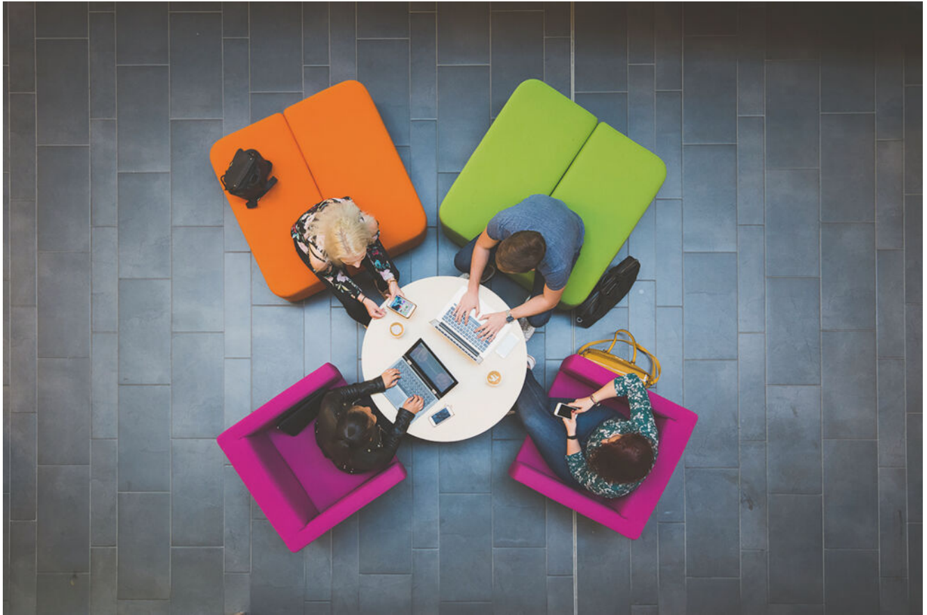
Image 2. Digital competence and adaptability, among others, are important future skills.

The report paints a multifaceted picture of future skill demands, consistently highlighting that a skilled and adaptable workforce is paramount to managing profound changes. Across all nine regions, several overarching themes emerged as critical for strengthening resilience: